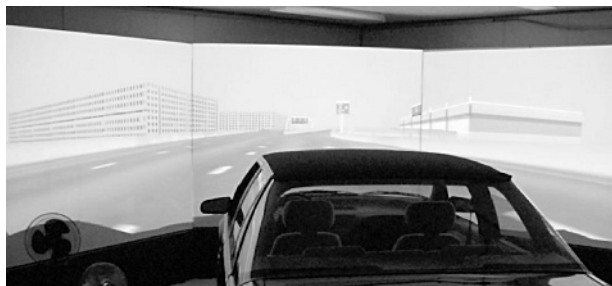
Figure 2 University of Massachusetts driving simulator.

lag behind it a reasonable distance (the lead vehicle indicated to the participant driver when to turn and in which direction).