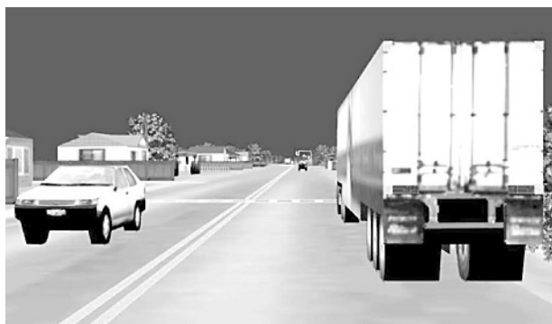
Figure 3 Simulator view: truck crosswalk scenario.

One of the potential weaknesses of the above study is that the trained novice drivers were evaluated on the driving simulator immediately after they had completed the PC based training. In order to remedy this shortcoming, the above study was replicated, only this time 12 novice drivers were evaluated on the simulator 3–5 days after training. 29 This represents a period of time which might elapse between PC based training in driver education classes and the novice driver's applying that training on the road as part of the learner's permit phase. Another set of 12 participants was